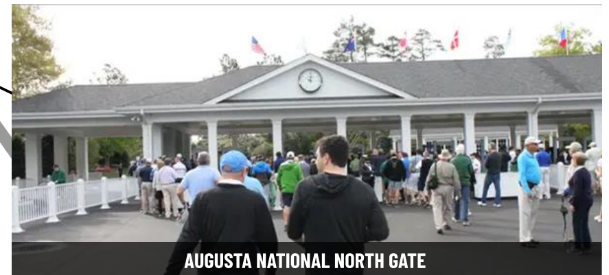
AUGUSTA NATIONAL NORTH GATE