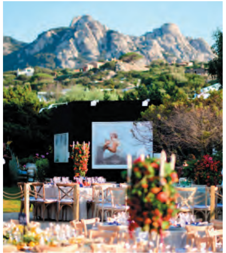
The Stunning Venue

Working with the team behind some of the world's most successful and high-profile fundraisers (among them amfAR's Cannes event, The Prince Albert II of Monaco Monte Carlo Gala, The Leonardo DiCaprio Foundation St. Tropez Gala and Elton John's Oscars event), UNICEF will call upon their star-studded list of Goodwill Ambassadors to support and take part in the gala. This is guaranteed to be "the event" of the summer.