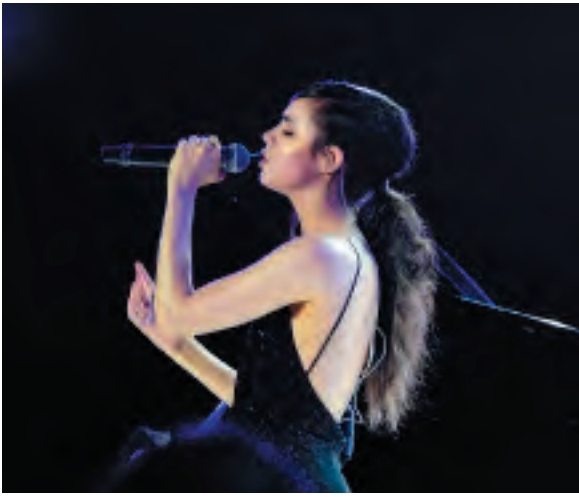
Sofia Carson performs