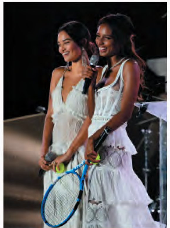
Shanina Shaik and Jasmine Tookes