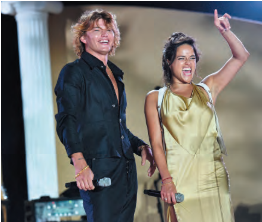
Jordan Barrett and Michelle Rodriguez

On August 9, 2019 UNICEF will hold its second annual Summer Gala in Porto Cervo, Sardinia, Italy. Set against the backdrop of the breath-taking Mediterranean Sea in one of the island's most breathtaking settings, the event will feature a languorous cocktail hour, seated dinner, live auction, performances, and more. This will be an occasion to reaffirm that every child counts and to support programs dedicated to protecting the invisible children - all the children in need.