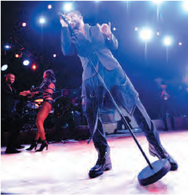
Ricky Martin Performs