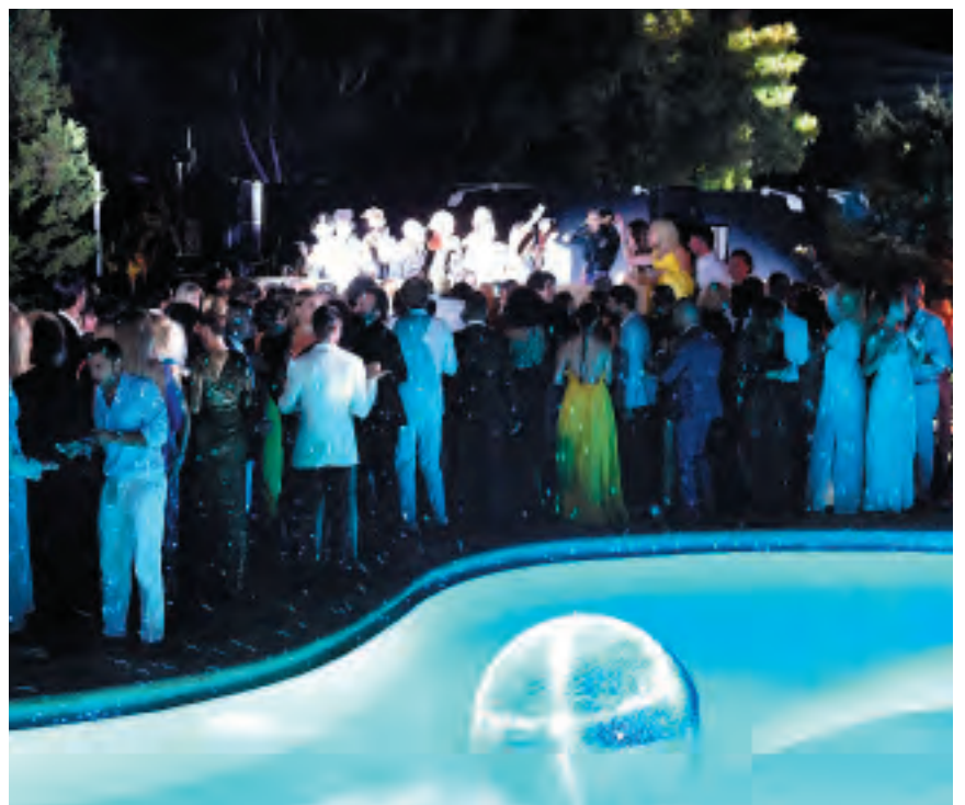
Guests at the After Party