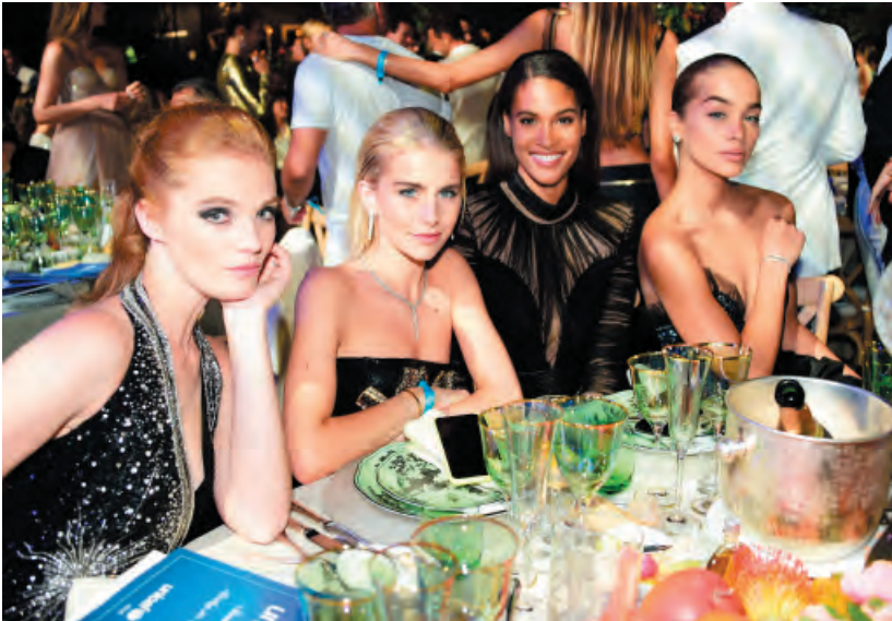
Alexina Graham, Caroline Daur, Cindy Bruna and Jasmine Sanders